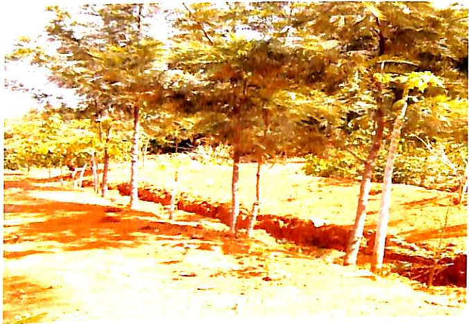
Plate 5: Trees planted along water retention ditches

Water harvesting and conservation structures are very important contributors to tree survival but are often ignored. Techniques that have proved very useful for dryland tree planting include water retention ditches such as cut-off drains, micro-catchments, and bottle watering.