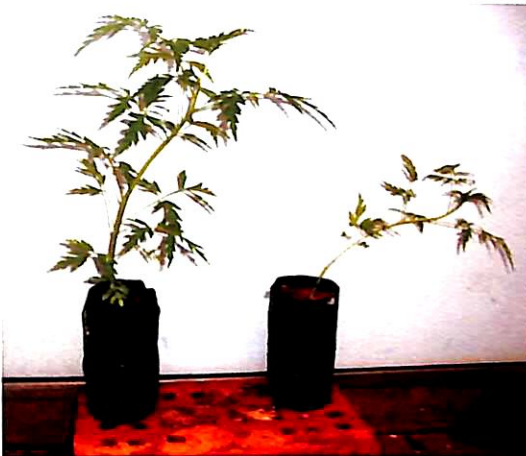
Plate 2: Hardened seedling of M. volkensis (left) has greyish stout stems. Unhardened seedling (right) is green and weak.

Hardening up is needed to prepare the seedlings to withstand the shock caused by possible harsh field conditions. Seedlings are hardened up in several ways such as through gradual removal of shade, increased frequency of root pruning, and reduced watering. If seedlings are from an external source, ensure that they have been hardened up. Characteristics of properly hardened up seedlings are stout stems and fewer but stronger leaves (Plate 2).