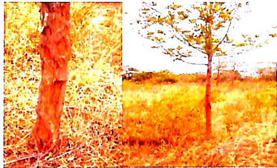
Plate 8: Grevillea robusta infested with termites