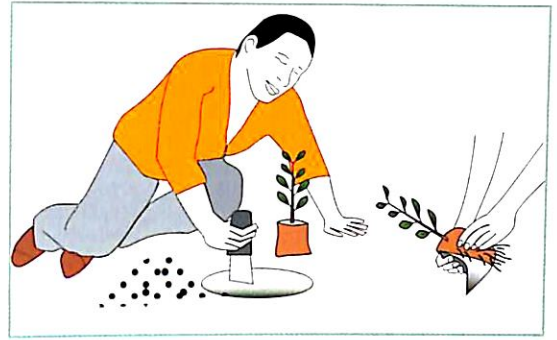
Figure 3: Planting a tree seedling

The best time to plant tree seedlings is immediately the rainy season begins. The earlier the planting the better the tree survival, as this exposes the planted trees to the maximum rainy days possible before the dry season starts. There should be enough moisture on the ground before you plant. Make a hole the size of the seedling container in the middle of the planting pit using a jembe or a machete (Figure 3).