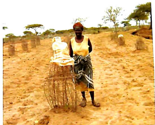
Plate 7: Individual tree protection

If you have many trees it may be cost effective to fence the entire plot. You can use chain link or barbed wire. Chain link fencing is expensive but very effective for control of all types of animals while barbed wire fence is moderately expensive but may not be able to control small animals such as young goats and dik diks. A barbed wire fence when reinforced with thorny branches can be quite effective for both large and small animals. You can further reduce the cost of fencing by relocating the fence to a second location after the trees are big enough.