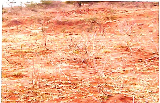
Plate 4: Low survival of trees due to poor soils and low soil moisture