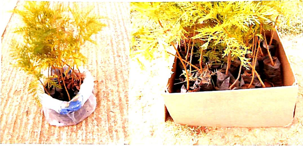
Plate 3: Well packed seedlings ready for transportation