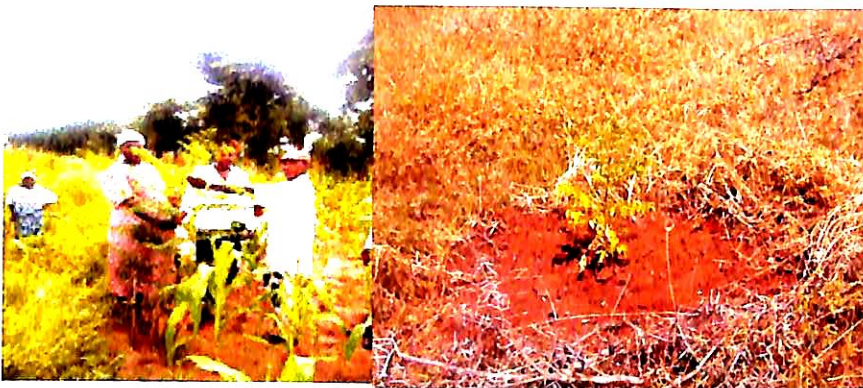
Plate 9: Completely weeded Melia volkensii trees (left) and spot weeded Melia of the same age (right)