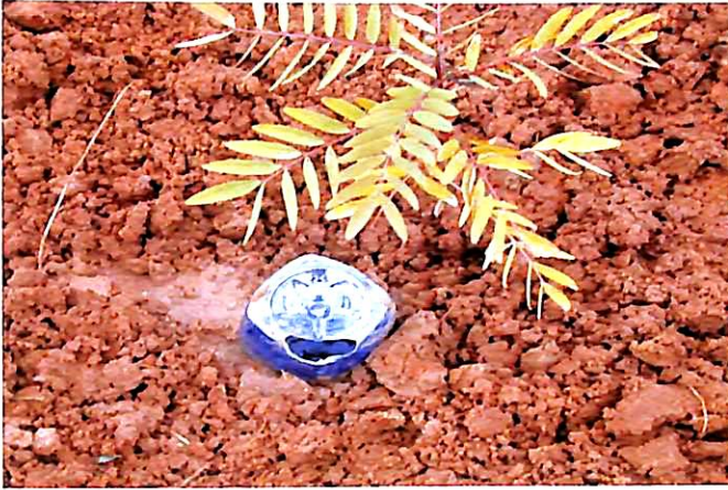
Plate 6: Bottle watering of Senna siamea

making a tiny hole in the bottom corner of a 3-5 litre plastic bottle and inserting it full length near the tree seedling (Plate 6). The technique reduces water loss through evapo- transpiration and reduces the frequency of watering. A 3-litre bottle can last for a week.