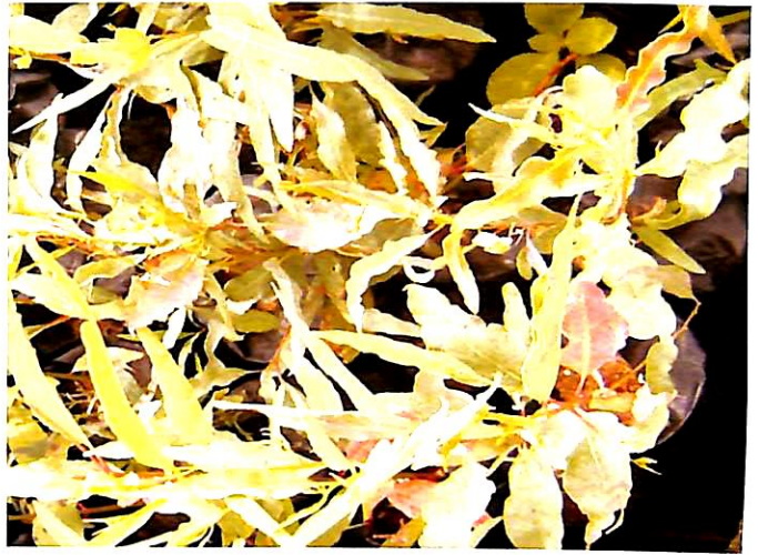
Plate 1: Diseased seedlings of Eucalyptus camaldulensis

You can also spray insecticides/fungicides on the seedlings before planting.